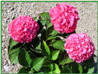
Beautiful blooms on our Hydrangea Hortense. Plenty of these gorgeous container plants remain available!