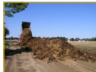
Smells okay to us!: Manure from our cattle operation is a key ingredient in the quality of our plants, and one of many reasons farming is so important to our overall success.