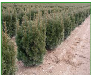
Taxus Majestic: our own introduction and a great sub for Hicksi.

I thought there would never be a question that I’d have to answer more often than “How do you spell your name?”, but the green industry’s seemingly insatiable appetite for large Hicksi yews, along with the apparent shortage of them in the marketplace, have combined to prove me wrong. Demand for even 18-24” Hicks has been so great that we were forced to dig out of our spring block last fall to meet orders. That means that the 18” Hicksi that many of you will be receiving this spring will be no larger than middle-of-grade, certainly not the sort of grading generosity we strive for. If you have any flexibility in your order, I highly recommend trying our Majestic yew. It has beautiful dark green needles, is a quick grower, and most importantly, we have them at a more generous grade than our Hicksi right now.