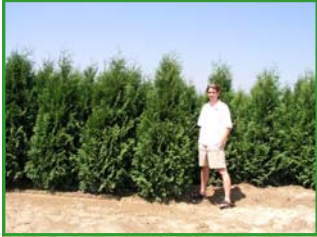
Our block of large Nigra arborvitae outside Hagan (no hobbit himself) by a healthy margin.